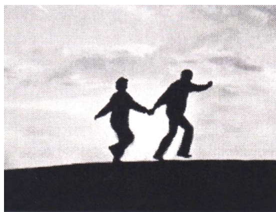
Dancing in The Sun